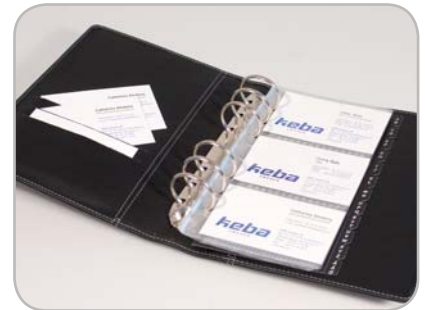
Will hold 420 p business- cards