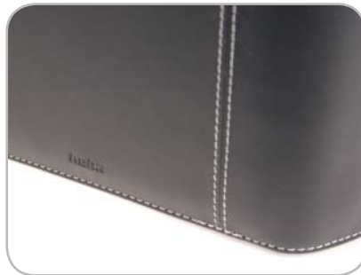
Tolerant to moist and damp with hide feeling