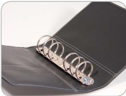
Extra large mechanism, 35 mm

Businesscard binder Hand sewed with a nice leather touch. Holds up to 420 p business or credit cards.