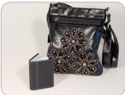
Handy size (suitable for hand-bag or trouser pocket)