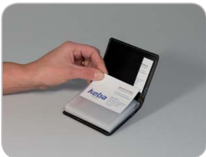
Will hold up to 40 p business or creditcards