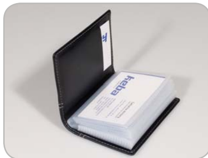
Tolerant to moist and damp with hide feeling