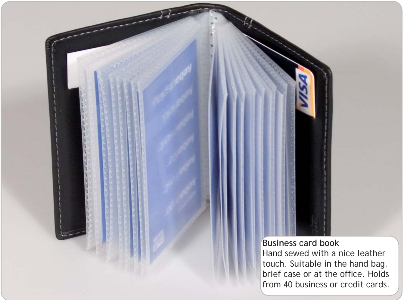
Business card book Hand sewed with a nice leather touch. Suitable in the hand bag, brief case or at the office. Holds from 40 business or credit cards.