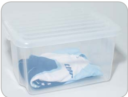
The content is protected against dust and dirt