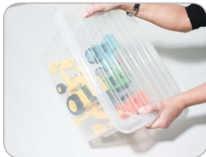
Easy to carry