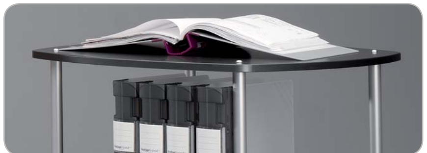
To adjust to a specific need, just add or remove a shelf