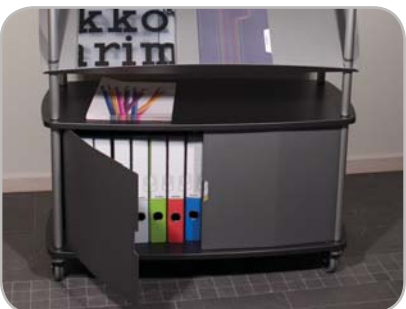
Accessories: leaning shelves, counters with magnet locking, and additional standard shelves