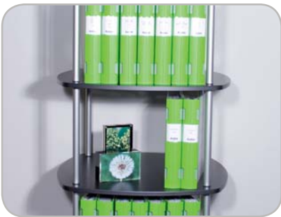
Modern and flexible shelf system

KEBAflex - contemporary flexible shelves A modern and easy to handle system for storage of binders with lots of possibilities to configure to each need. Anthracite grey with brushed aluminium poles.