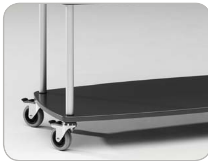
Provided with lockable wheels