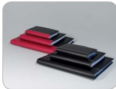
A4, A5, A6