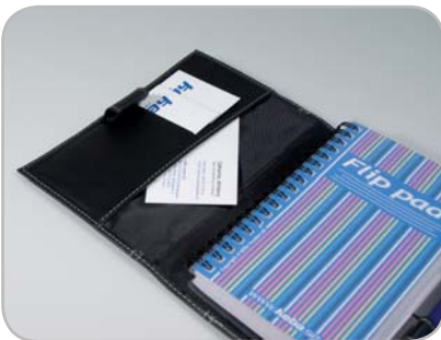
Room for business card