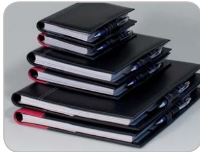
Leather like cover, resistant to moisture