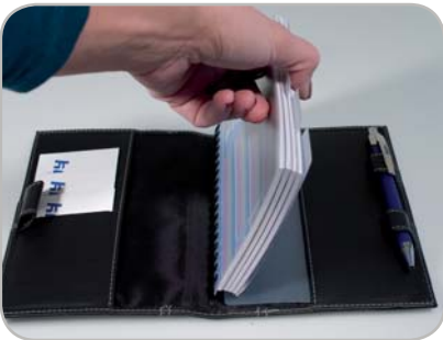
Exclusive pad covers with seamed borders

Pad cover Hand sewed with that quality leather like touch. An elegant cover for note pads with room for business cards and pens.