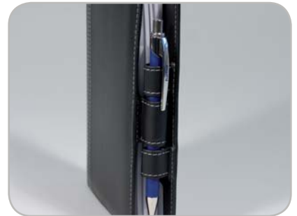
Pen holders (with locking function)